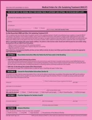
MOLST Form Section A