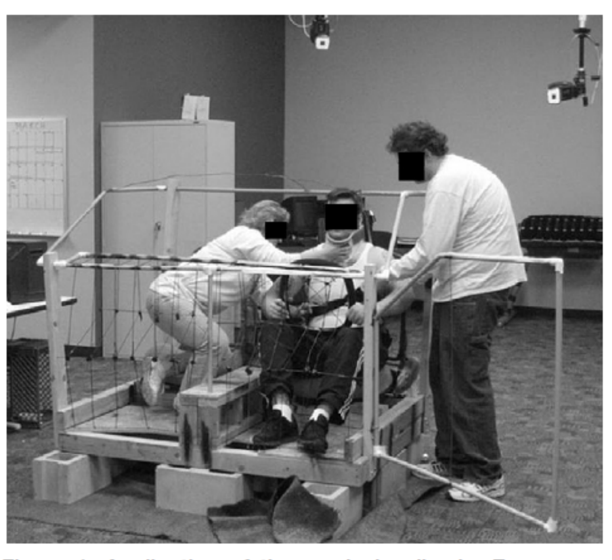
Figure 1. Application of the cervical collar by Emergency Medical Services personnel in the mock automobile. Visual monitoring cameras recording head and trunk movement of victim.