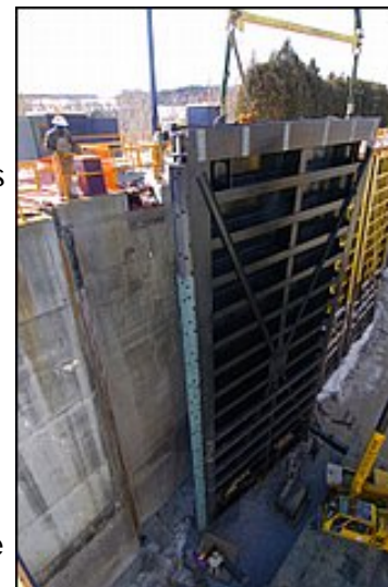
Major repairs set at Lock 6