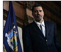
Paterson: Senators’ pay at risk