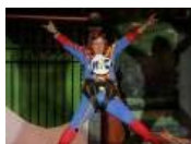
Politicians Goofing Off