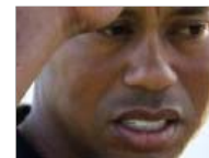
Celeb Train Wrecks