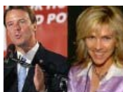
Political Sex Scandals