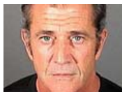
Celeb Train Wrecks